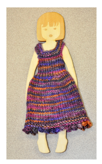
Kris: ""Bundle Up Betty" doll with hand knitted dress