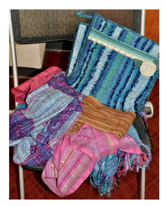
Cindy's "treasure" scarves & bags, Woven on rigid heddleloom