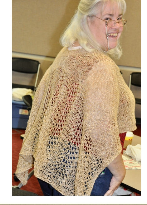
Liz's lace knit shawl