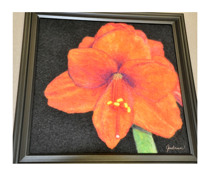
Goodie's wet & needle felted amaryllis