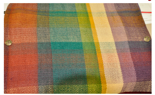
Heather's handwoven poncho