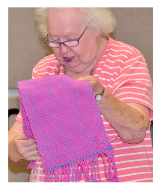
Selma's log cabin scarf