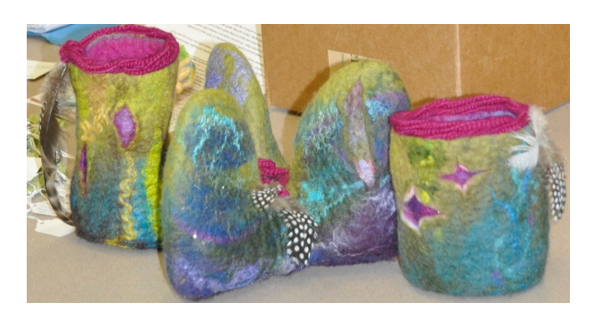
Janet's wet felted vessels