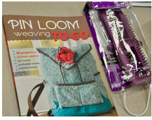
Ingrid: new pin loom book & Loop& Threads Knit Quick Sock Loom (which can be used as adjustable pin loom)