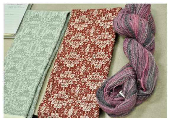
Judy's handwoven towels & handspun lace yarn