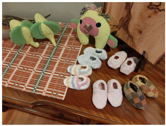
to mention the adorable booties!

That is all the photos sent in this month...So here's a few from our last few meeting! Do you know the stories behind the photos?