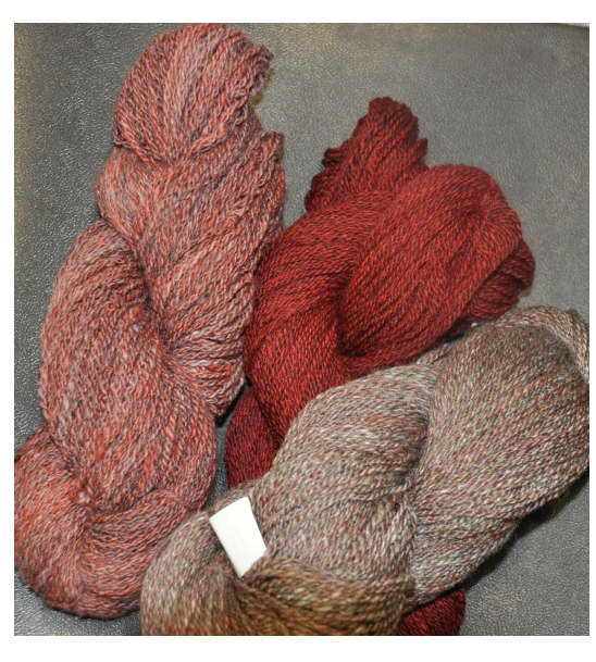
Judy's latest handspun ^