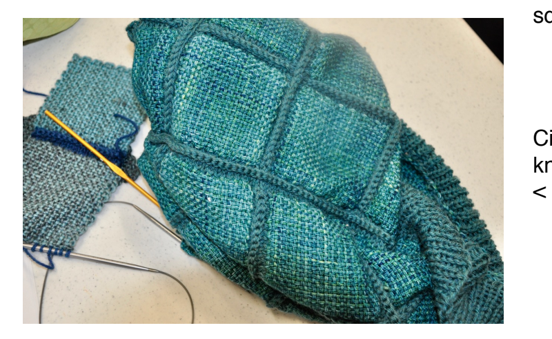
Cindy's pin loom shawl with knitted joins