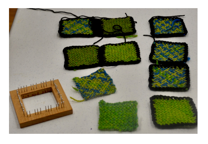
Crocheted edging on pin loom squares