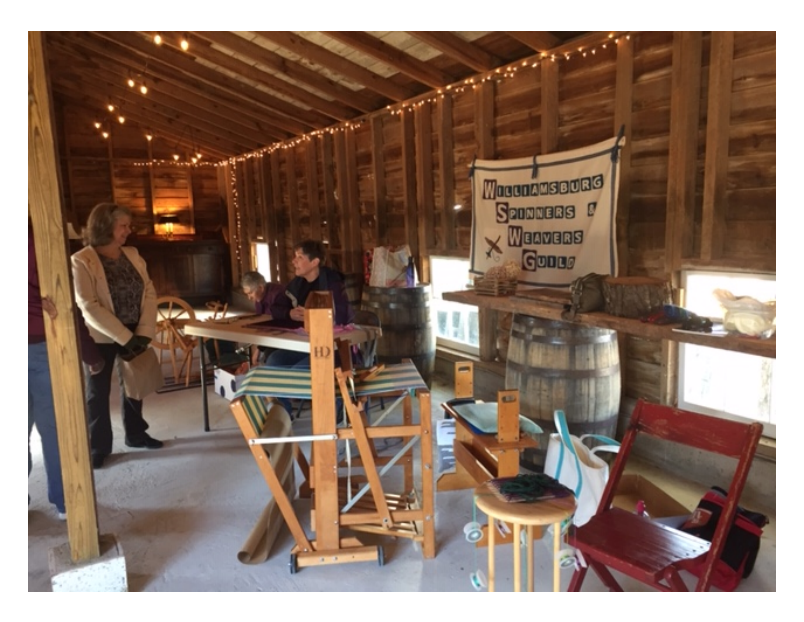
Peace Hill Farm Fiber & Craft Festival