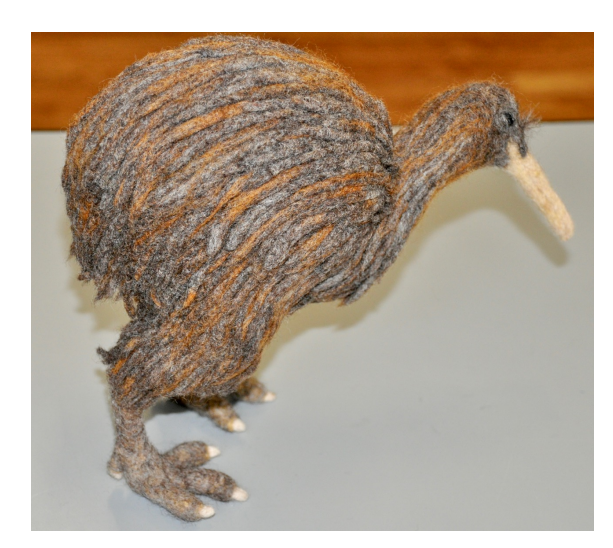
Goodie's needle felted kiwi