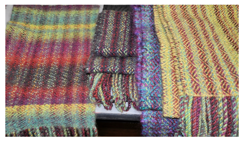
Kathy's 4 striped woven alpaca scarves from 60 Scarves for 60 Years