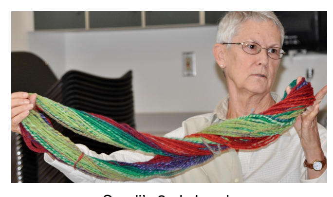
Sandi's 3 ply handspun