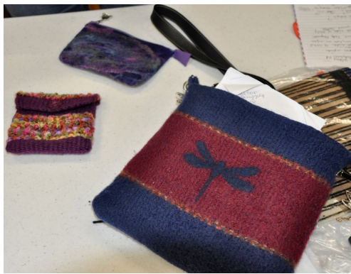
Felted woven bag