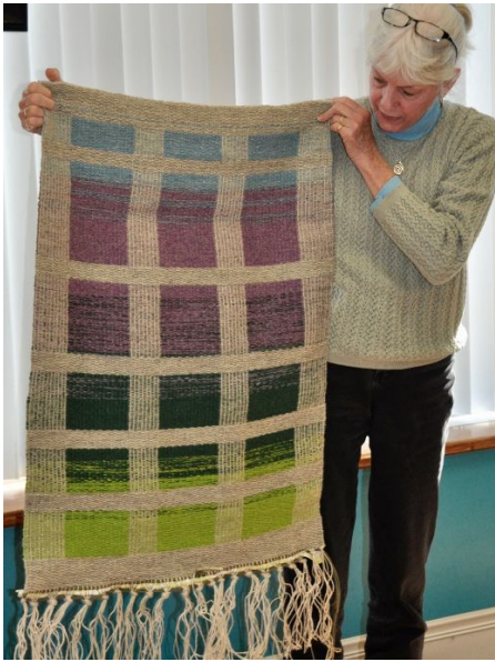
Four color rug