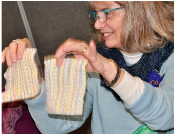
Handwoven kitchen cloths