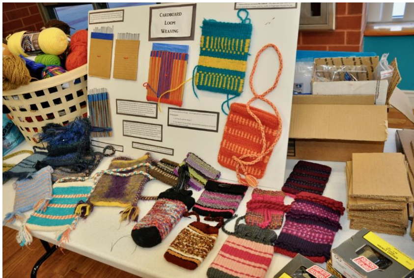
More on open show for textile art....Williamsburg