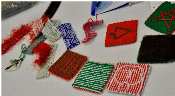
woven on pin loom