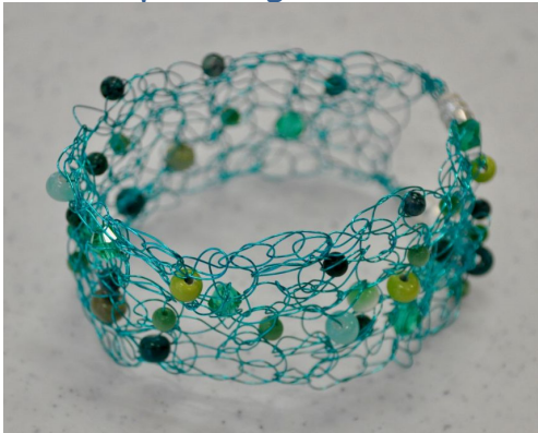
crocheted wire bracelet