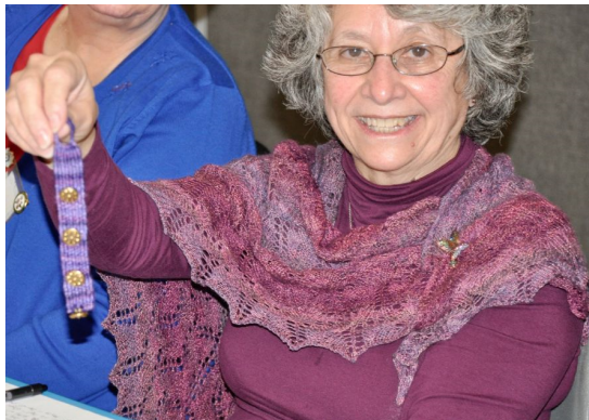
Pin loom bracelet and knitting softness