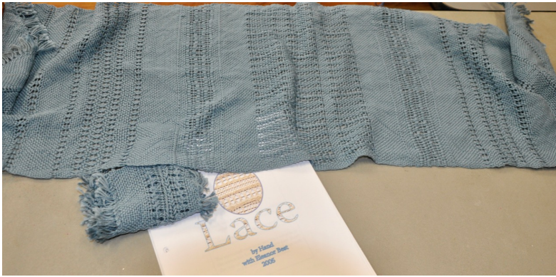
Cindy's lace sampler & Eleanor Best's lace weaving handout