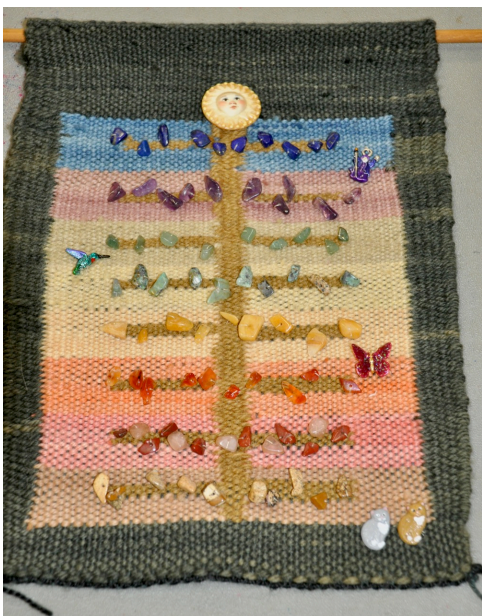
Debbie's Navaho-style Beaded Tree Tapestry