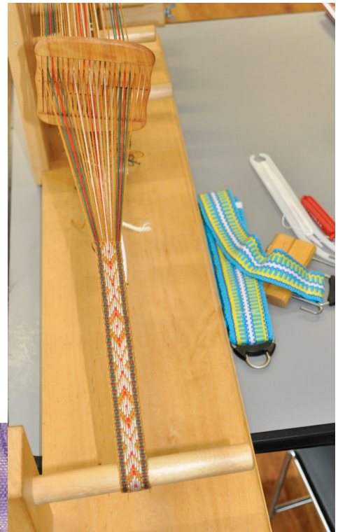
Sami band weaving with wooden Sami heddle on inkle loom base