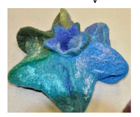
Janet's 3D felted vessels