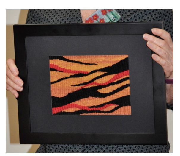
Goodie's 4 color tapestry <

Marsha's 4 color ^ "cranberry bog" tencel scarf