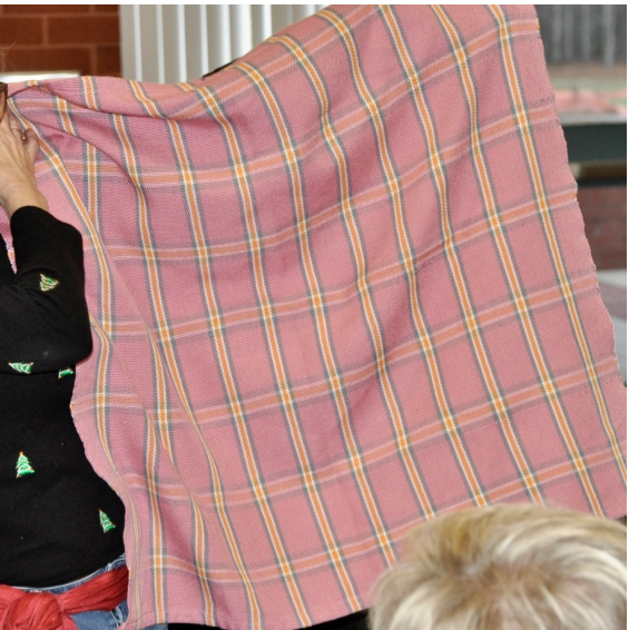
Kathy's 4 colorbaby blanket ^ & 4 color summer & winter scarf <