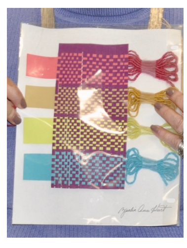
And Ann's Preliminary Worksheet >