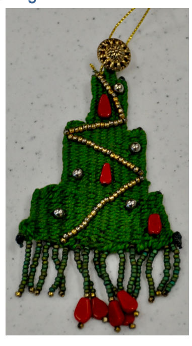
Catherine's needle woven Christmas ornament