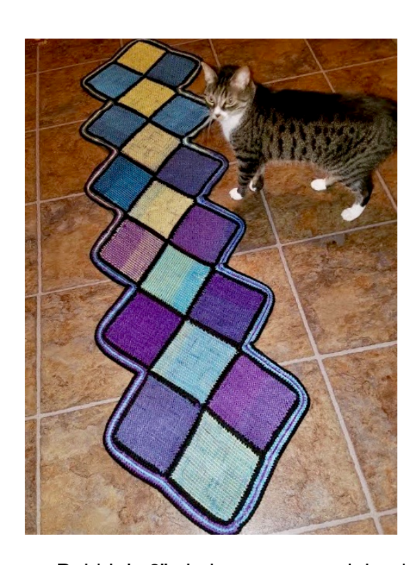
Debbie's 6" pin loom squares joined diagonally to make scarf. (Ok, pic taken at home, because...cat!)