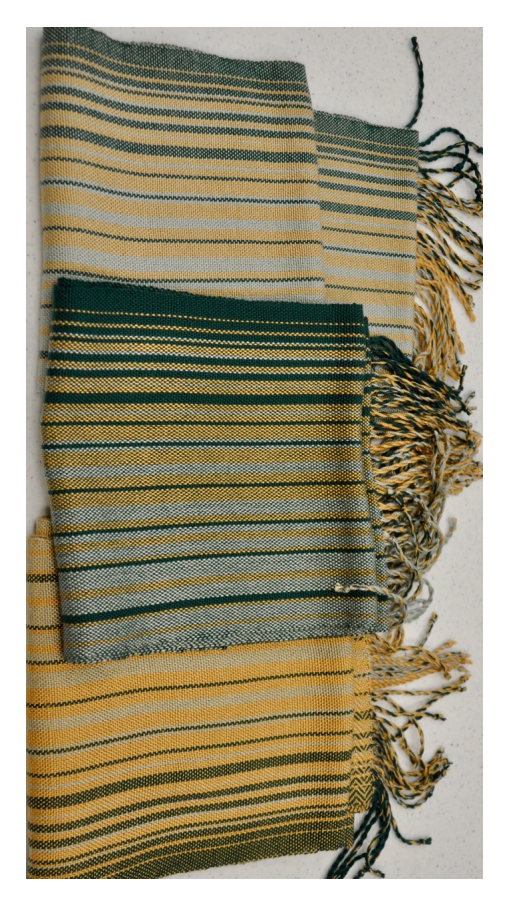
Kris's handwoven scarves