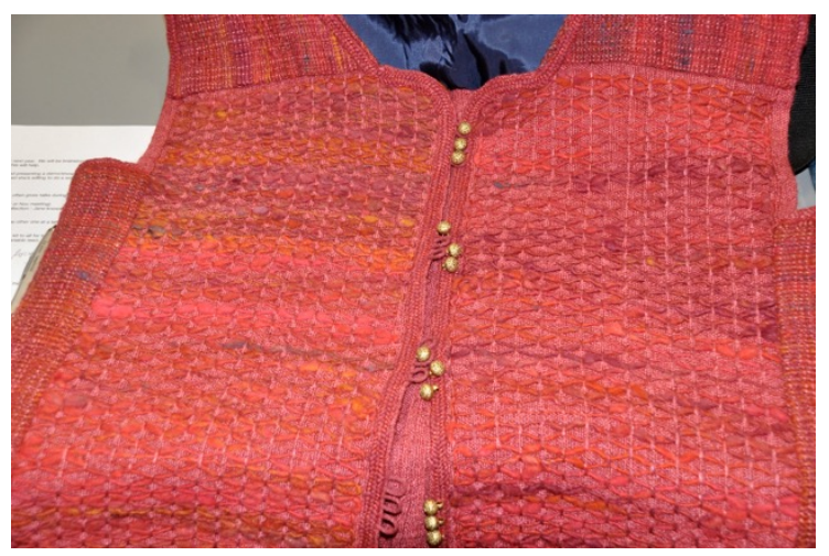
Sandi's woven & kumihimo vest ^