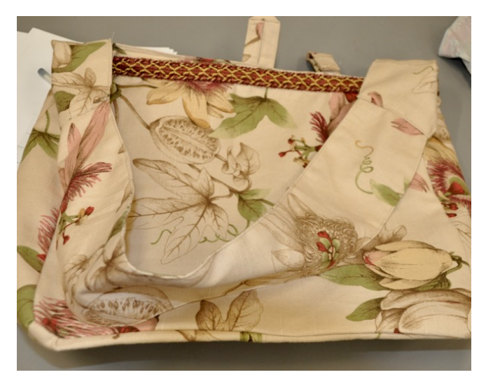
Goodie's multi strip bag