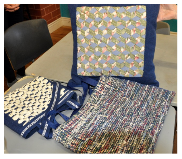
Marsha's fabric strip bags & pillow