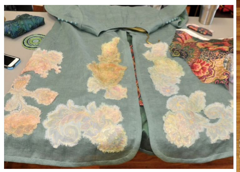
Ann's woven coat with appliqued fabric flowers