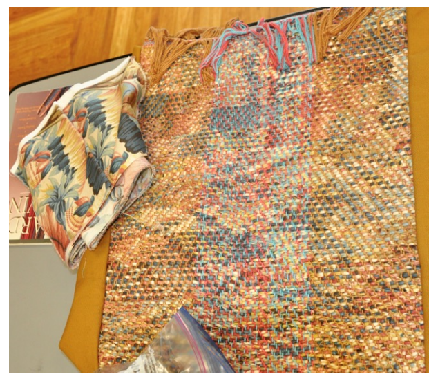
Izabela's woven strip yoga bag