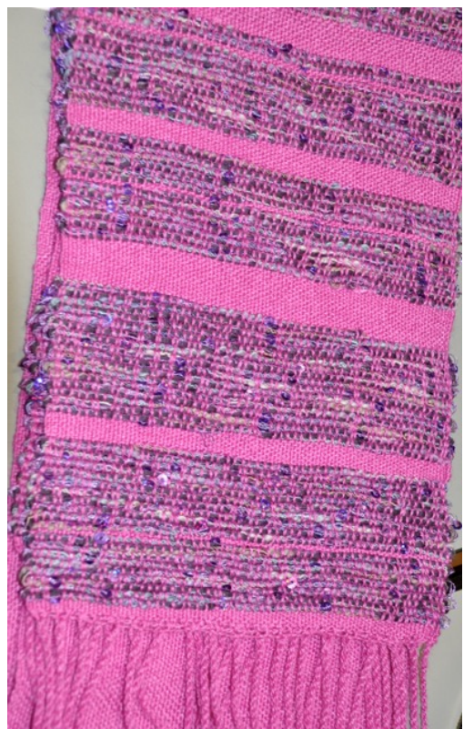
Kris's rigid heddle scarf ^^