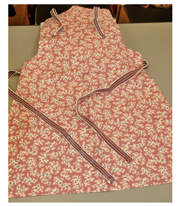
Claudia's fabric apron with inkle straps