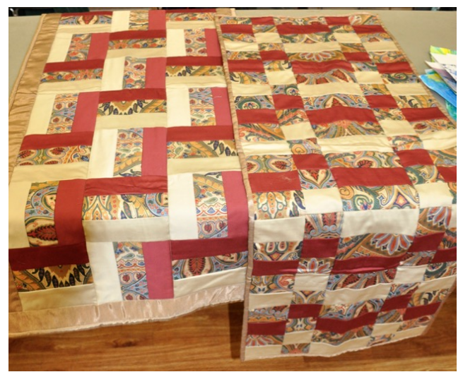
Micki D's quilted table runners

WSWG December 2017 Meeting Results of Fabric/Fiber Stash Challenge