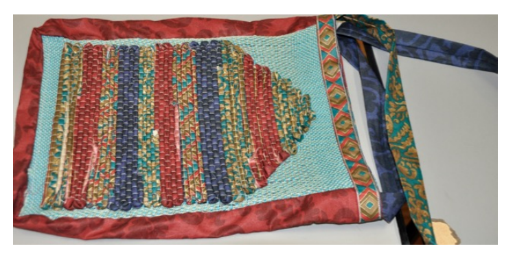
Debbie R's fabric & woven bag ^