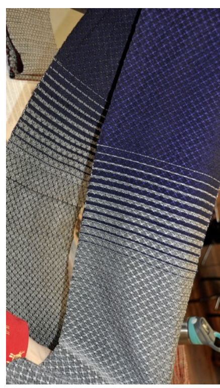
Judy's infinity scarves