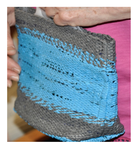
Goodie's plarn lunch bag <