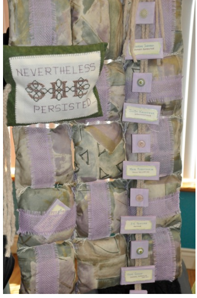
Debbie K's wall hanging noting great women