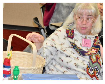
< ^ > From the basket making workshop