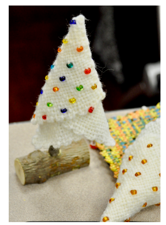
Goodie's pin loom Christmas trees