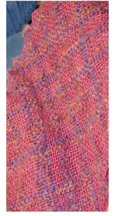
Liz's find: ^ a diagonally woven scarf