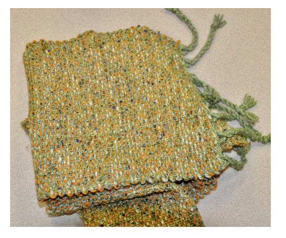
Sandi's tencel scarf >