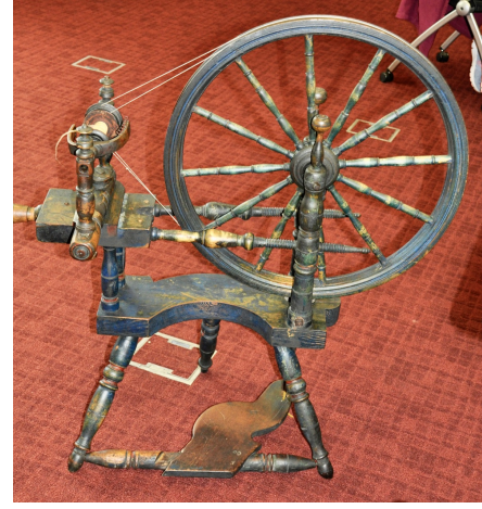
Ingrid's "new" 1890 Norwegian Spinning wheel