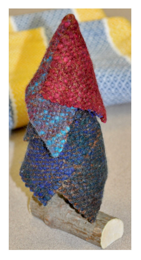
Sandi's felted squares Christmas tree