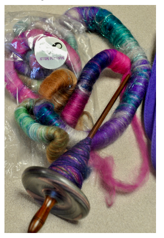
July meeting spin-in!