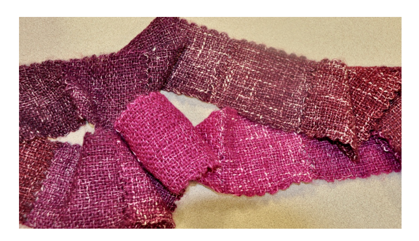
Goodie's pin loom Mobius scarf ^