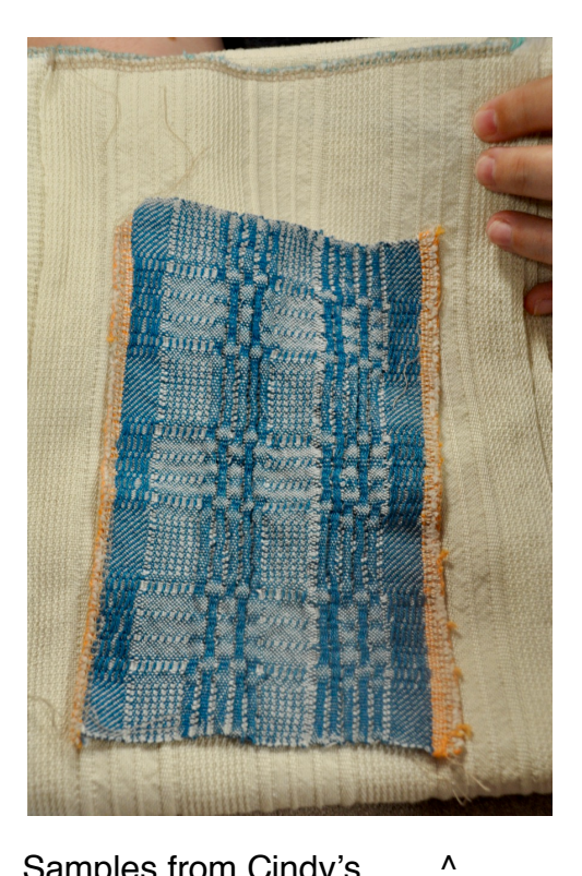
Samples from Cindy's MAFA class

Back strap loom & weaving from Tina's class