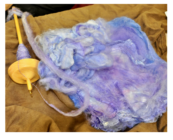
Spin in! ^