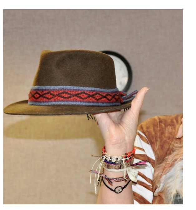
/ I I C