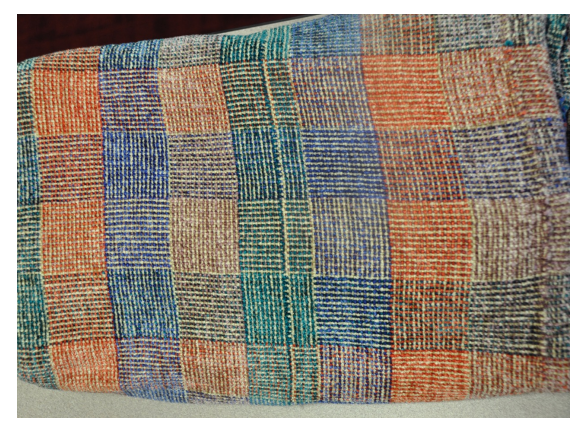
Marsha's log cabin doubleweave throw with "design element"

Debbie's Peyote stitch beaded neck pendant