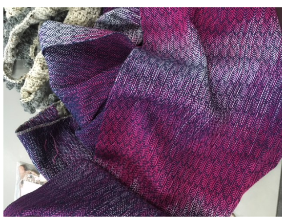
Natalie's 8 shaft lkat weaving