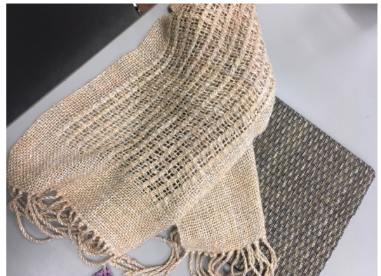
Heather's rigid heddle weaving with Iza's yarn